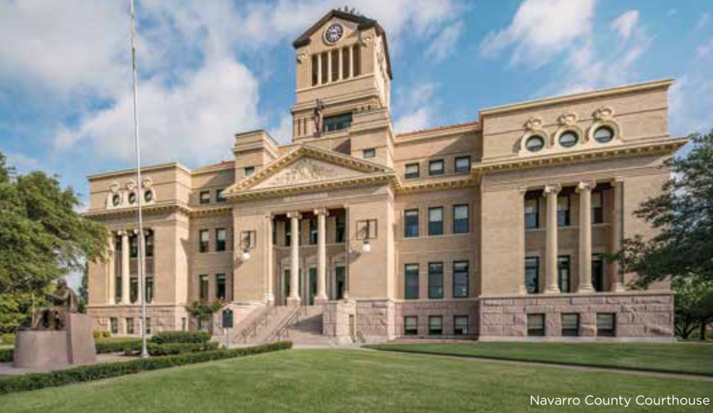
Navarro County Courthouse