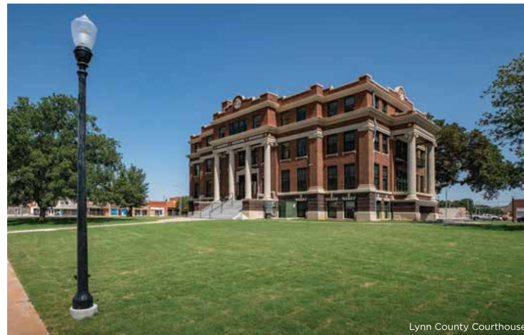
Lynn County Courthouse

Integrating systems into a building while retaining its historic appearance is always a puzzle, as in the case of the Lynn County Courthouse. According to Braddock, the arrangement of all required services behind walls and above ceilings was the most difficult aspect of the project.