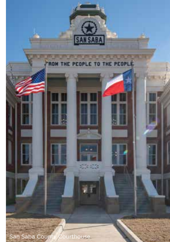
San Saba County Courthouse