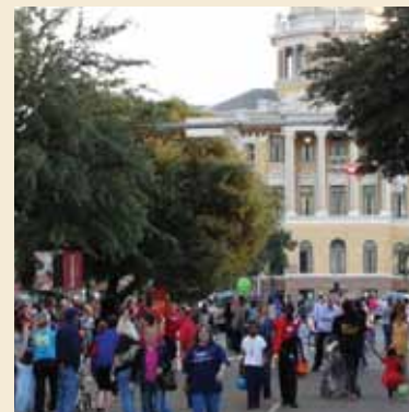
Left: Second Saturday Car Show; Above: Second Saturday in downtown Marshall