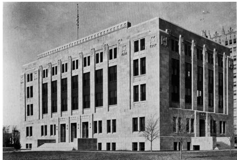
Midland County Courthouse, Midland, circa 1933

What people may not realize about courthouses is that they have archives of your county. That is where the births are recorded, and where the marriages are recorded, and where the deaths are recorded. With those old archives, those old papers and books, which are easy to be destroyed by both light and temperature, much less by fire, it's really important to restore those archives and make sure they're protected.