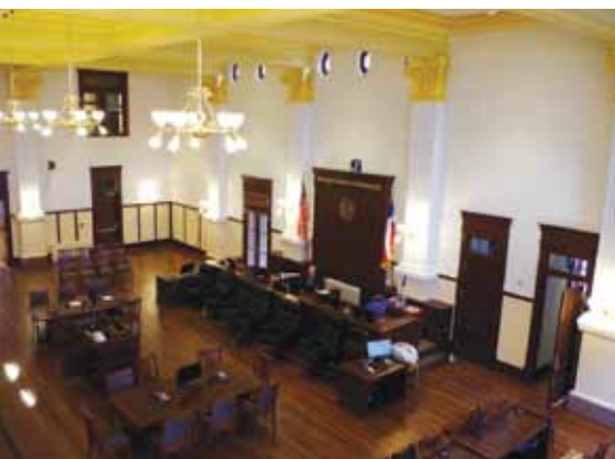
The courtroom designed by J. Riely Gordon in 1896 was restored and reopened in January 2015.

Exterior restoration work—initiated through a THCPP Round VI grant—is a continuation of efforts undertaken in 2002–04, with the assistance of a Round I grant. That funding helped preserve and restore exterior masonry walls, windows,