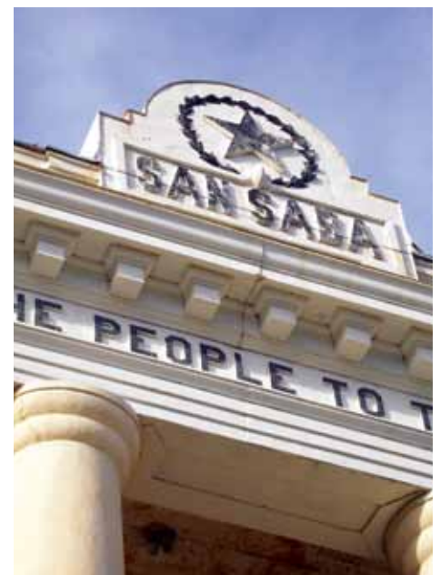
Right: 1911 San Saba County Courthouse, San Saba

Many factors contribute to the threat of fire at historic Texas courthouses, but significant ones include outdated electrical systems, lack of lightning protection, and inadequate fire suppression and