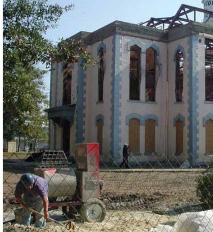
The 1903 Newton County Courthouse was restored after a devastating fire, Newton

and the state. These records hold not only vital information, but are some of the earliest known histories of Texas.”