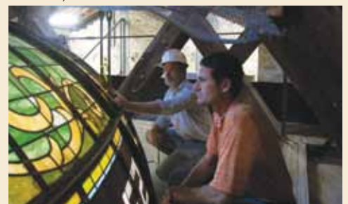
Left and below: 1891 Edwards County Courthouse, Rocksprings and 1891 Colorado County Courthouse, Columbus, both rededicated 2014