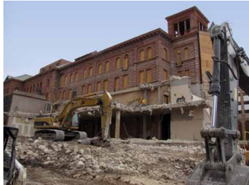
Recent work at the Bexar County Courthouse used demolition robots for efficiency.

The Bexar County Courthouse is visited by more than 10,000 people daily. As one can imagine, integrating the construction activities with trials and other county business presented unique challenges. Several months prior to the August 2013 groundbreaking, county staff members relocated courts, offices, and entire departments, and organized temporary and permanent rerouting of mechanical and electrical systems.