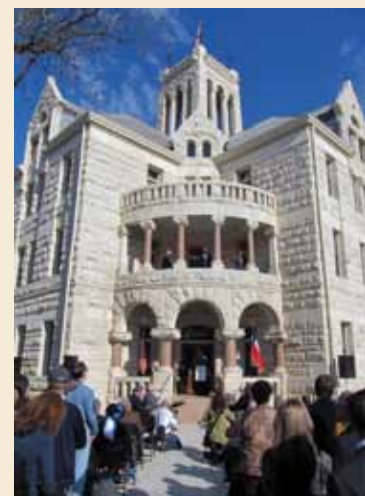
Comal County Courthouse, New Braunfels, rededicated 2013