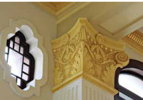
Restored decorative pilaster capital and quatrefoil window

generator, electrical, mechanical, and plumbing systems. A mechanical floor lift is cleverly incorporated into the judge's bench to allow the adjacent seating to be at one level while remaining