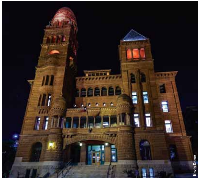
The 1896 Bexar County Courthouse is a treasured historic landmark in a city with a rich heritage.

The $22 million exterior restoration began where the other project ended—removing the modern building additions on the