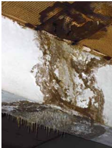
Stalactites formed by water damage, 1923 Polk County Courthouse, Livingston

smoke detection systems. Many lack modern alert systems that warn occupants and summon firefighters simultaneously.