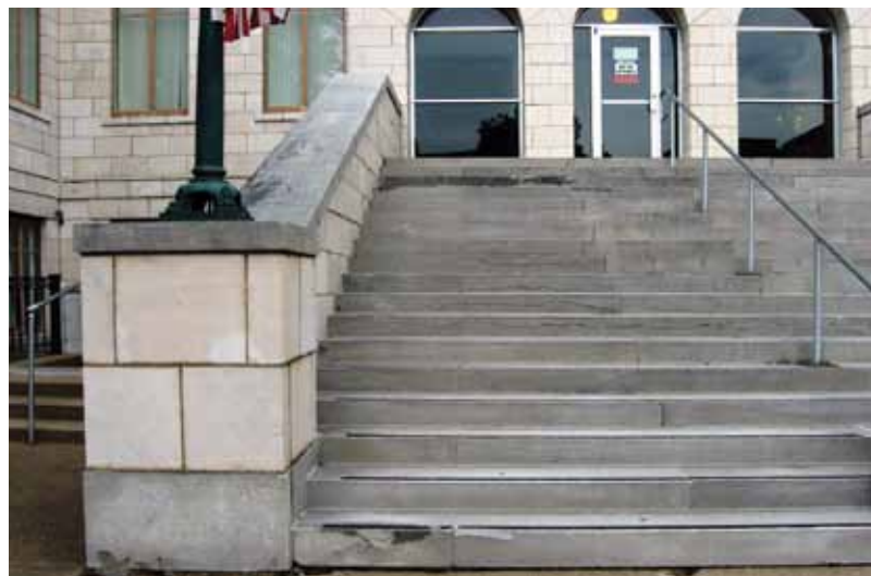
One of two entry stairs at the 1929 Hunt County Courthouse, Greenville, closed due to structural deficiencies

After a full restoration, county officials must continue to be diligent in maintaining their restored courthouses or face these threats all over again. That’s why the THC established the Texas Courthouse Stewardship Program in 2005. The program offers technical assistance and education through regular workshops and site visits.