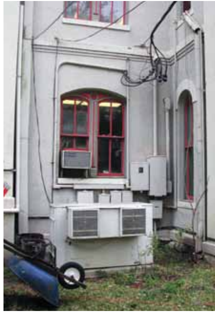
Previously, localized fires have occurred due to aging electrical and mechanical systems in the 1891 Tyler County Courthouse, Woodville