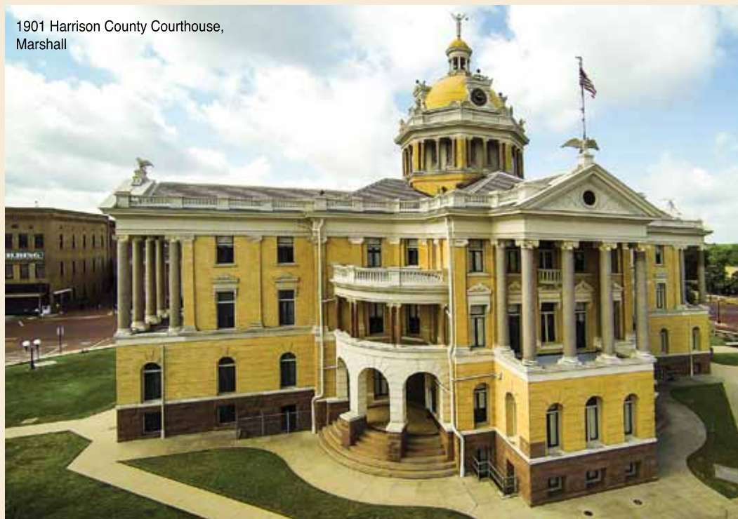
1901 Harrison County Courthouse, Marshall