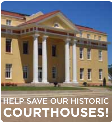
Cass County Courthouse