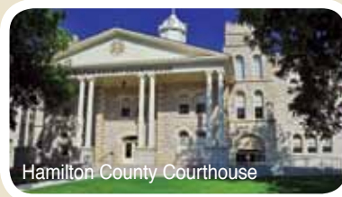
Hamilton County Courthouse