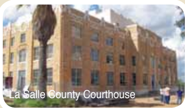
La Salle County Courthouse