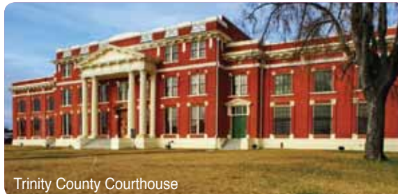
Trinity County Courthouse