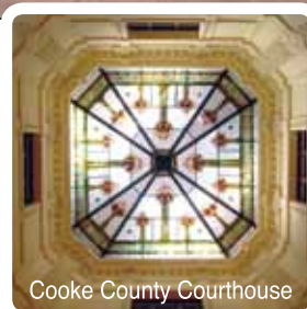
Cooke County Courthouse