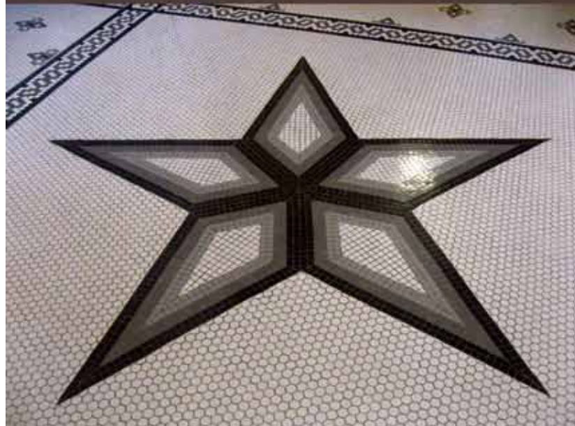
Terrazzo tile floor, Roberts County Courthouse