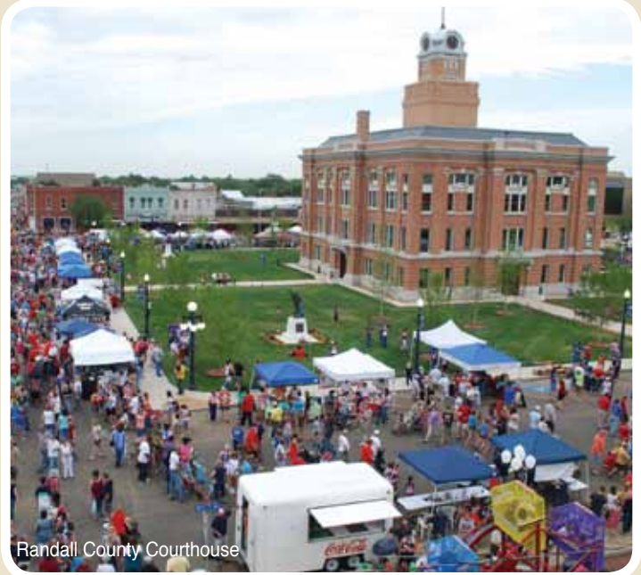
Randall County Courthouse