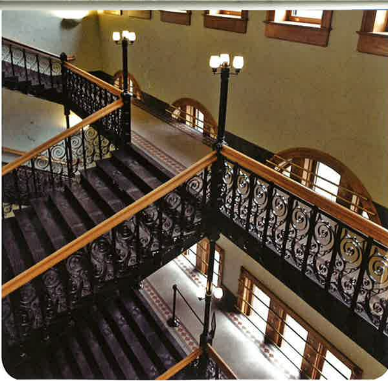
Dallas County Courthouse

Where the Williamson County Courthouse sees tourism cross-promotions because of its relationship to area museums, other courthouses experience this benefit from the presence of a museum being contained within its own walls. The increased visitation the Denton County Courthouse-on-the-Square has received reflects this partnership. Since 2003, the visitation to the Courthouse-on-the-Square Museum and other area government facilities has increased from 41,428 visitors to 84,849 in 2007.