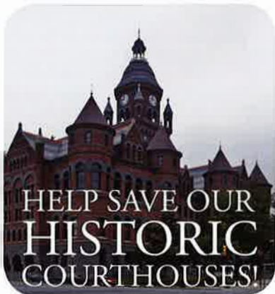
Dallas County Courthouse

PRESORTED STANDARD U.S. POSTAGE PAID AUSTIN, TX PERMIT NO. 1938