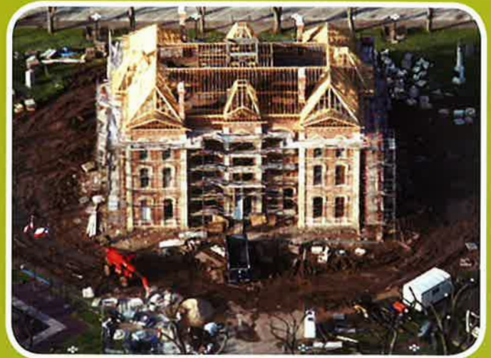
The restoration included the demolition of the 1940s additions and replicating the pressed metal shingle roof and clock tower.

The THC recently consulted representatives from Bee, Harrison, Presidio and Wharton counties about the impact of the Texas Historic Courthouse Preservation Program on their communities. The overwhelming consensus was their courthouse restorations played a crucial role in the resurrection of their downtowns and often acted as the primary impetus for economic renewal of the business districts adjacent to the historic courthouse square.