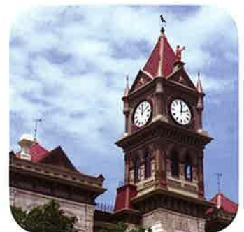
The 1886 Bosque County Courthouse in Meridian originally had a Gothic tower and small turrets which were dismantled in 1935 and rebuilt in 2007 during the restoration.