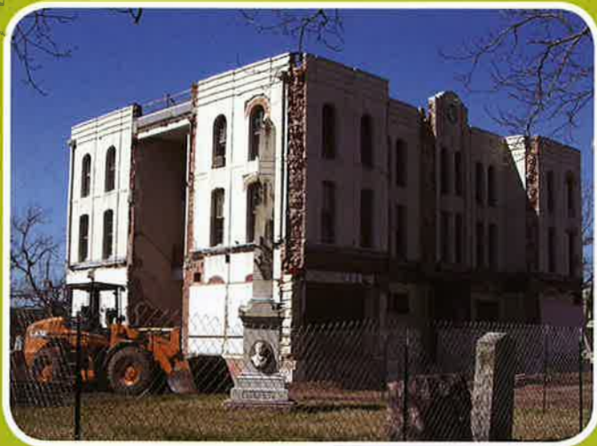
A stucco exterior, added in 1935, is removed from the 1889 Wharton County Courthouse.