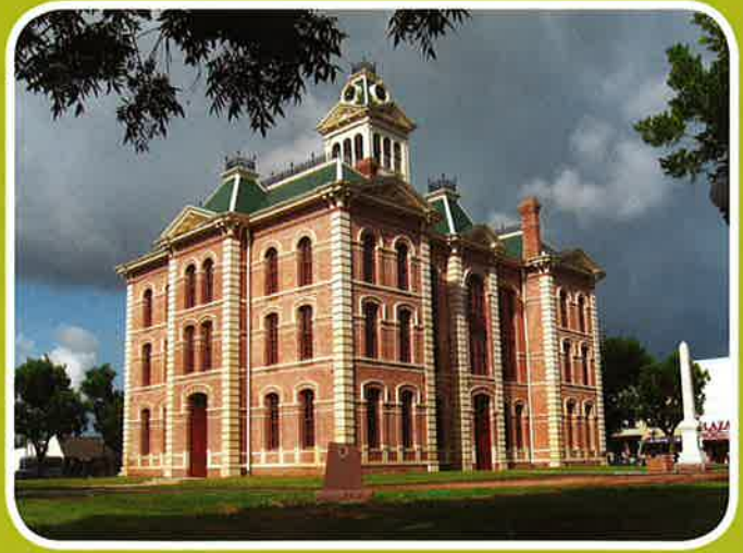
The project is considered one of the most dramatic restorations in the program.