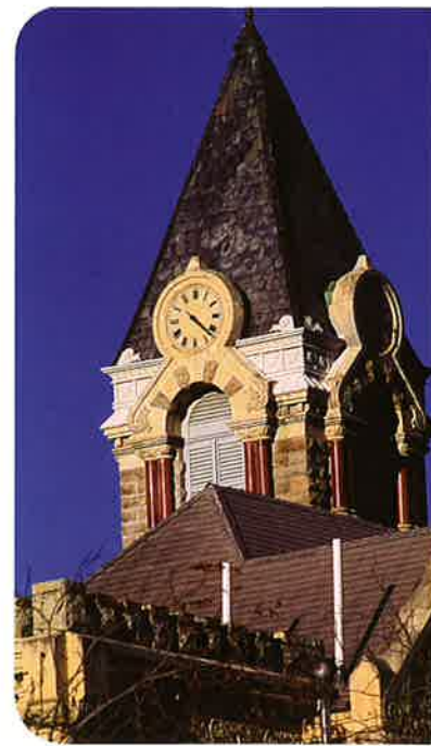
Fayette County Courthouse