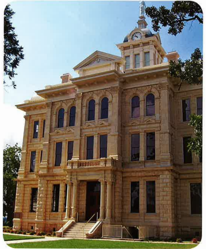
Milam County Courthouse