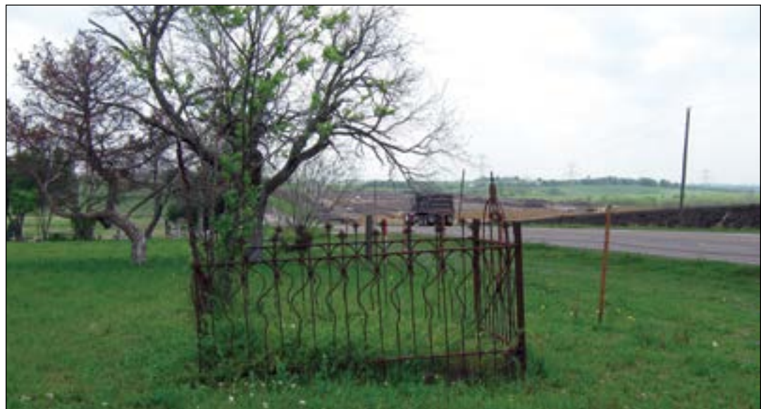
The federal review process identifies cultural resources, including historic cemeteries, within a project area.

Professional archeologists usually make a map of the cemetery and document the gravemarkers and any other features (depressions, fencing, and plantings) associated with the cemetery. Archeologists and physical anthropologists may be present to identify and study human remains and grave artifacts during manual excavation of the interment. Often, information is recorded from the gravemarkers to provide historical documentation, such as the length of occupancy of a land tract or ethnic affiliations in the community. This documentation can assist archeologists and historians in