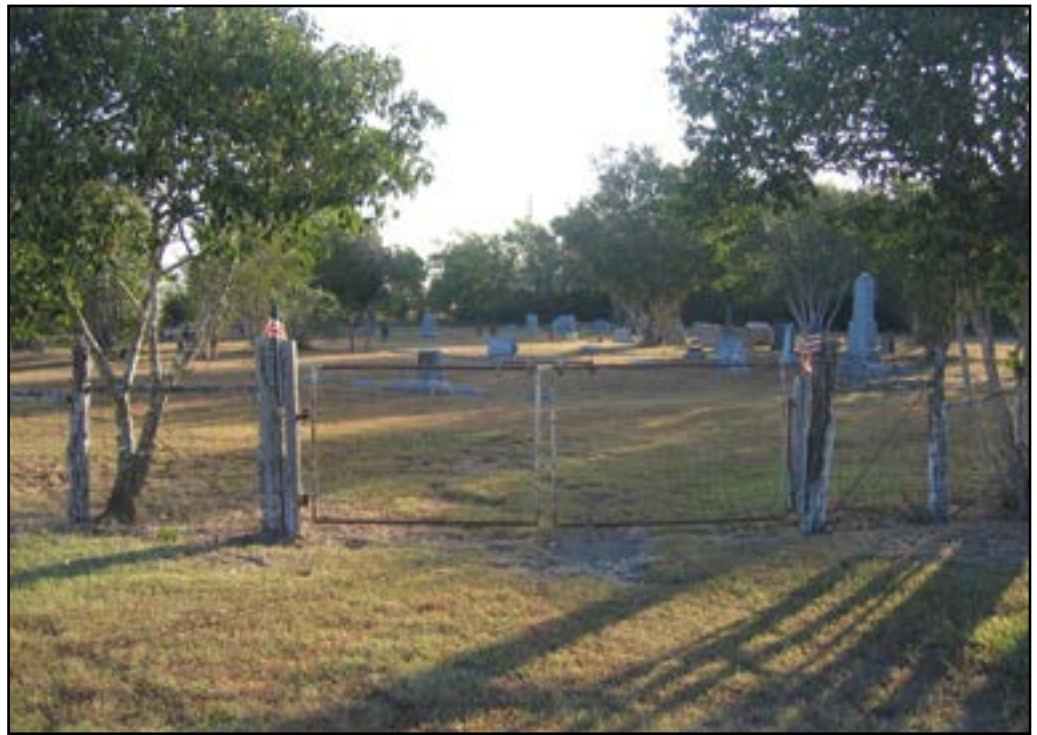
Appropriate fencing allows for monitoring of the cemetery and helps prevent desecration.

Erect fencing that is appropriate for the site. Livestock can knock down and trample gravemarkers, desecrating a cemetery. Deter vandals from damaging urban cemeteries by installing fencing that is easily seen through, allowing police and concerned citizens to see