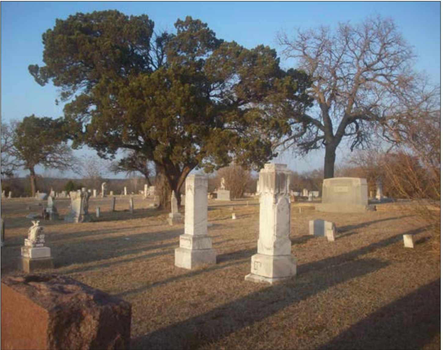
Historic cemeteries are irreplaceable cultural resources that tell the real stories of Texas.

Cemeteries are among the most valuable of historic resources. They are reminders of various settlement patterns, such as villages, rural communities, urban centers, and ghost towns. Cemeteries can reveal information about historic events, religions, lifestyles, and genealogy.