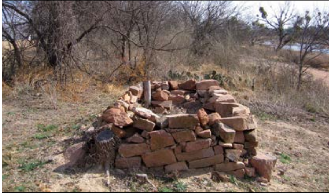
Single graves are considered cemeteries, and are protected by the same laws.

Section 711.001 of the Health and Safety Code defines a cemetery as a place that is used or intended to be used for interment, containing one or more graves. Section 711.035 of the Health and Safety Code states that once a property is dedicated for cemetery use, it cannot be used for any other purpose unless the dedication is removed by a district court or the cemetery is enjoined or abated as a nuisance. Property is considered dedicated if one or more burials are present or a dedication of the property for cemetery use is recorded in the deed record.