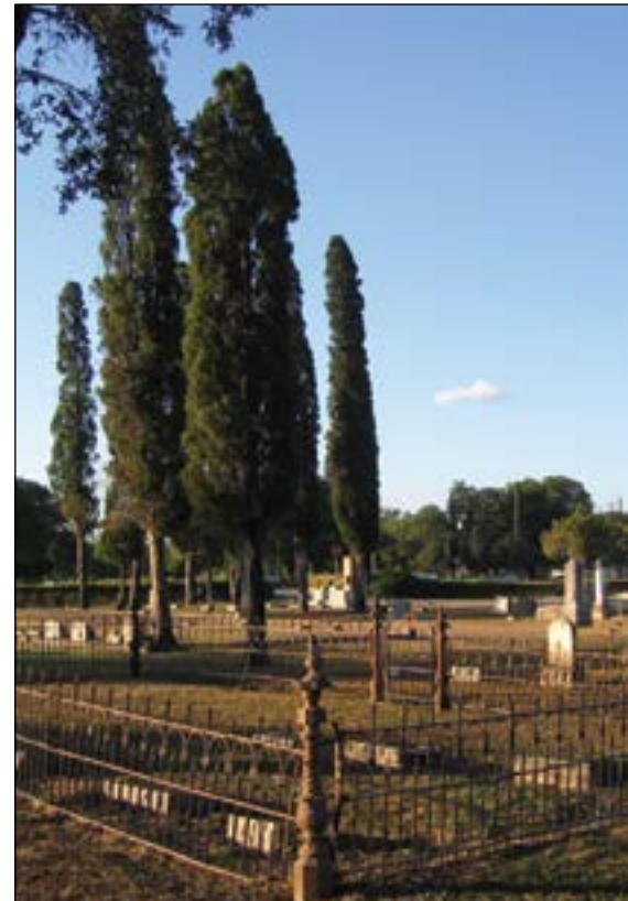
Municipalities that own or control a cemetery have the power to maintain it.

Chapter 712 of the Health and Safety Code governs the operation of perpetual care cemeteries, regulated by the Texas Department of Banking.