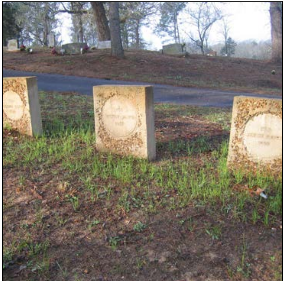
Handcrafted gravemarkers represent important regional customs and traditions.

If prehistoric or unmarked burials are encountered, stop work immediately and contact the THC's Archeology Division for advice at 512-463-6096 or archeology@thc.texas.gov . Prehistoric grave sites contain fragile, easily destroyed remains. Investigation by qualified archeologists may be necessary if the history in these sites is to be properly preserved. Simple documentation and stabilization of the find may be all that is needed in such cases. State law requires the recording of unknown or abandoned cemeteries with the county clerk. Notice of Existence of Cemetery forms are located on the THC website at thc.texas.gov/notice .