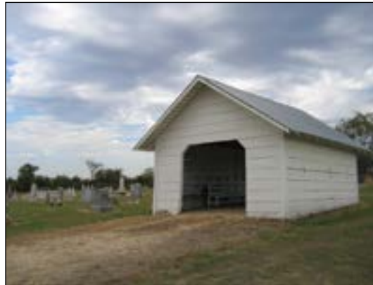
Historic structures contribute to the cultural landscape of a cemetery.