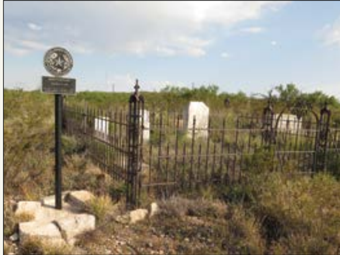
The HTC designation is an important tool for protecting and preserving historic cemeteries.

The HTC designation is an official recognition of family and community graveyards that encourages preservation of historic cemeteries. The designation imposes no restrictions on private owners' use of the land adjacent to the cemetery or the daily operations of the cemetery. Every county in Texas has at least one cemetery designated as a Historic Texas Cemetery through this program.