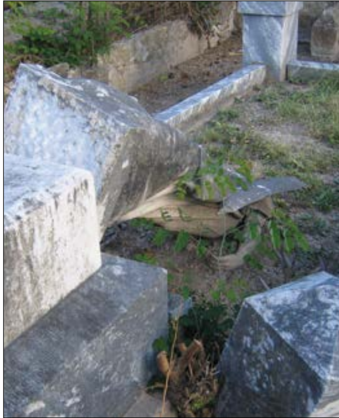
Contact local law enforcement immediately if you notice vandalism or theft at a historic cemetery.

Criminal action, or a court trial, may not always be the most appropriate method of dispute resolution. A civil lawsuit may be the only means of resolving a conflict involving a cemetery. For instance, a CHC in Central Texas surveyed the historic cemeteries in the county. Several years later, the fence and gravemarkers along the boundary of one of the surveyed family cemeteries had been removed. No gravemarkers remained to provide evidence of the graveyard; thus, only the survey proved the cemetery's existence. Since the site was being considered for development, the records of the CHC were crucial to the future disposition of the land. In this case, the descendants of those interred in the cemetery filed suit and were compensated in an out-of-court settlement.