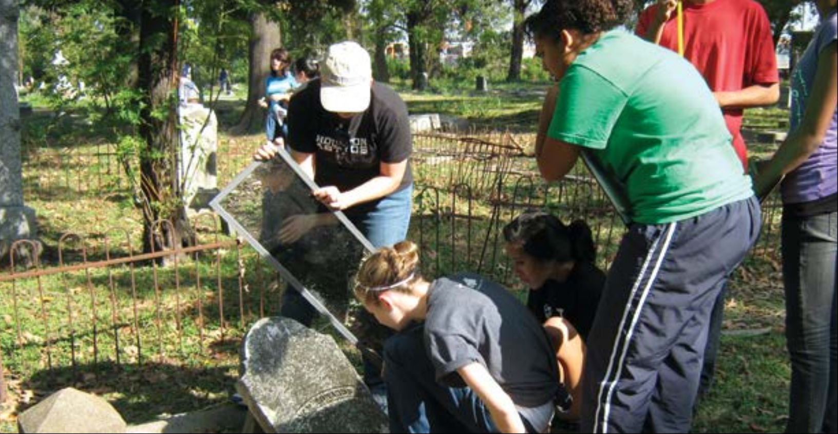
A mirror is used to illuminate inscriptions that are difficult to read, without touching or moving a damaged gravemarker.