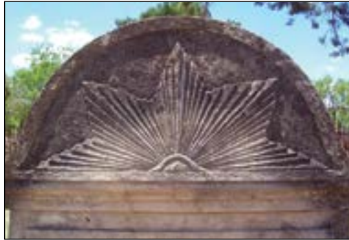
Limestone and marble were commonly used gravemarker materials in Texas in the 19th and early 20th centuries.

Most historic gravemarkers in Texas are carved from one of three different types of stone: marble, limestone, or sandstone. These stones are relatively soft and easy to carve; as a result, they were used extensively in Texas cemeteries during the 19th and early 20th centuries. Unfortunately, because these stones are soft, they are more susceptible to the effects of weathering than harder stones such as granite.