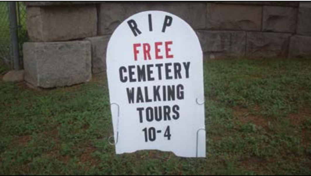
Volunteers raise awareness by organizing annual cemetery tours.

While vandalism and theft of gravemarkers, tombs, and cemetery features seem to be the most disturbing threats to any cemetery, simple neglect of maintenance is perhaps a more widespread and damaging problem.