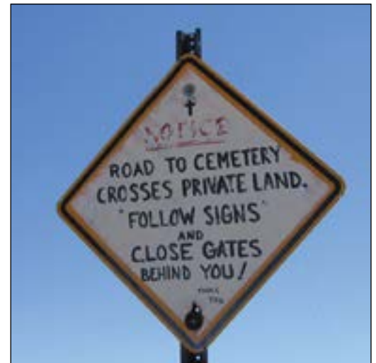
Access to historic cemeteries on private property is outlined in the Texas Health and Safety Code.

The fact that the remains of the dead buried in a cemetery have not been removed and that tombstones mark the places of burial is sufficient to show that the cemetery has not been abandoned. Michels v. Crouch , 122 S.W.2d 211 (Tex. Civ. App.—Eastland 1938, no writ). In Markgraf v. Salem Cemetery Assn. , 540 S.W.2d 524 (Tex. Civ. App.—San Antonio 1976, no writ), the court decided that land outside a cemetery fence was not abandoned because several graves were still evident.