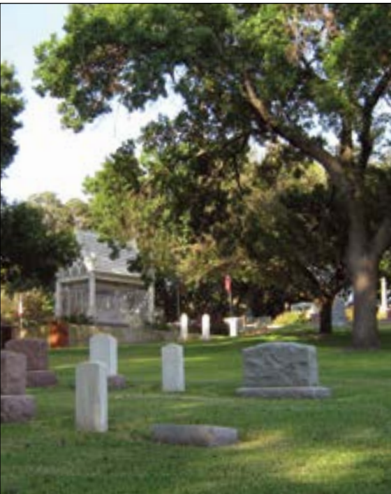
The THC issues Antiquities permits for work performed in publicly owned historic cemeteries.

If a historic cemetery is publicly owned by a state agency or political subdivision of the state (counties, cities, utility districts, etc.), the burials are protected under the Antiquities Code of Texas (Title 9, Chapter 191 of the Texas Natural Resources Code).