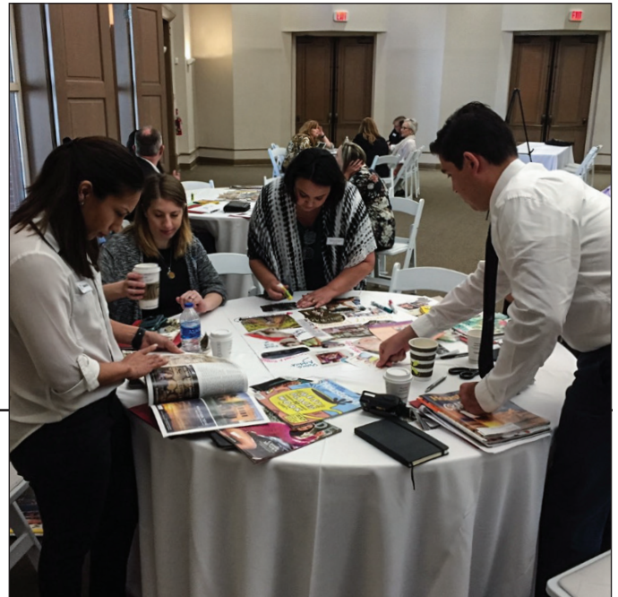
2019 Understanding Audiences and Visitors Workshop participants are creating visitor profiles.

database of history museums in the state via the THC's Texas Historic Sites Atlas ( atlas.thc.texas.gov ).