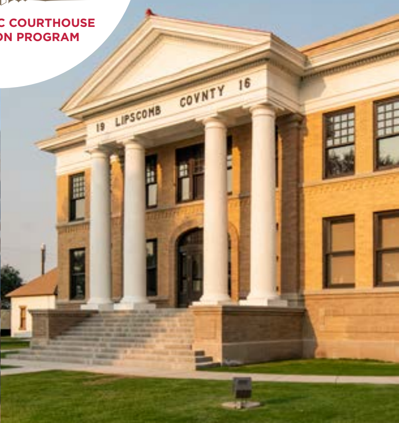
Clockwise from top left: Falls, Marion, Lipscomb, and San Saba County Courhouses