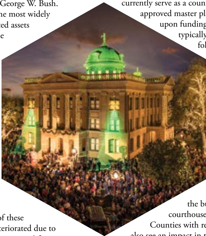
Above: Williamson County Courthouse, Georgetown

Counties with restored historic courthouses also see an impact in the form of improved building accessibility and usability, easier building maintenance, increased safety and energy efficiency, and downtown revitalization in addition to expanding local tourism.