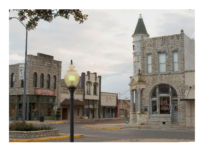
Better: more color and character

Okay: nice buildings and framing, bland colors