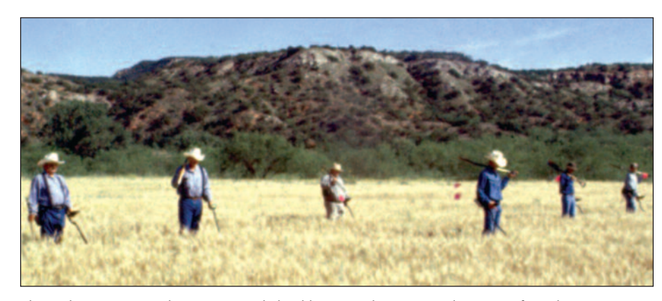
The Red River War Battle Sites Project helped locate and preserve military sites from the 1870s in the Texas Panhandle. The participation of volunteer archeological stewards and private landowners was essential to the success of the project.

Assisting in Cultural Resource Surveys. Although most steward assistance is given to the general public, professional archeologists carrying out state or federally mandated cultural resource surveys also call upon stewards to share their knowledge of local archeological resources. This activity helps preserve our regional archeological heritage.