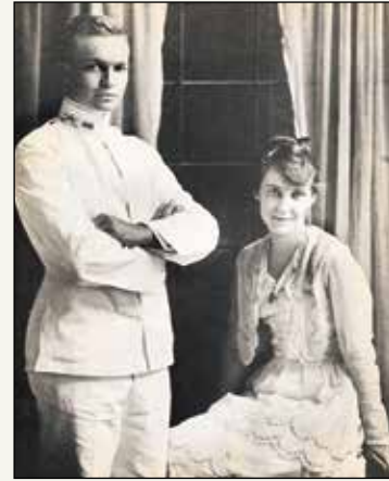
Dwight and Mamie.

One of the most significant political and military figures of the 20th century, Eisenhower began life in a modest household. His parents, David and Ida Stover Eisenhower, were better educated than much of the working-class population of Denison, having attended a small Kansas college, where they met and were married. Though neither graduated, David studied engineering while Ida took humanities classes and was especially fond of music.