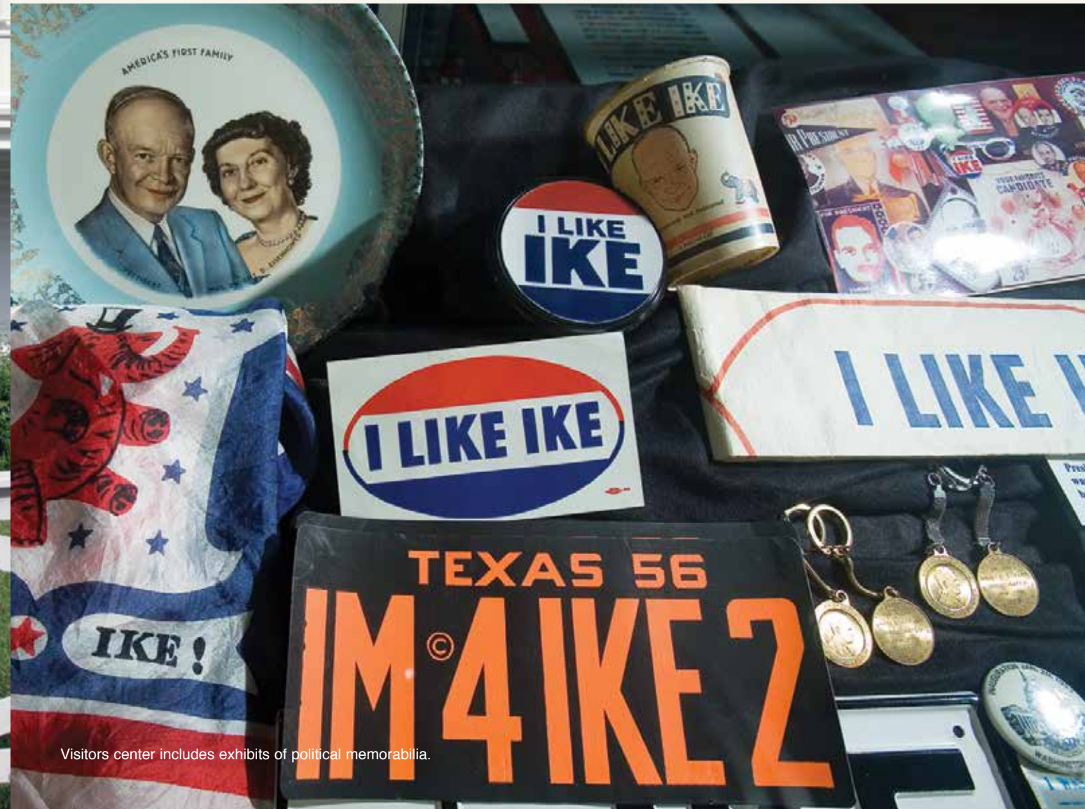
Visitors center includes exhibits of political memorabilia.

Exhibits showcase Eisenhower's many accomplishments as president and war hero. Explore "Ike" memorabilia, walk the site's gardens complete with a larger-than-life statue of Eisenhower, and hear the real story of the first Texas-born president.