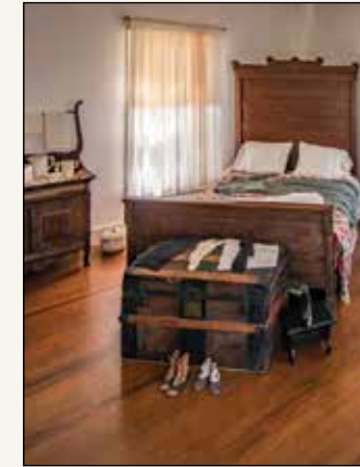
The downstairs bedroom.

Still at home in Abilene, Kansas, when he was nearly 21, Eisenhower was too old for admission to the U.S. Naval Academy, his first choice, so he opted to enter West Point instead. His mother, a religious pacifist, was not pleased with his decision to serve in the military. However, army life brought out the best in him, making him a top student in advanced training and a leader esteemed by his troops and fellow officers.