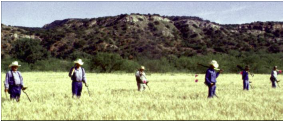
The Red River War Battle Sites Project helped locate and preserve military sites from the 1870s in the Texas Panhandle. The participation of volunteer archeological stewards and private landowners was essential to the success of the project.

details about the location and circumstances of the discoveries. Stewards document significant private collections and submit the data to the THC so that others can use these records for research. Recording private collections does not threaten ownership of a particular collection. However, stewards can help place a collection in a qualified archeological repository or museum for permanent protection and study. Stewards do not and should not be asked to evaluate monetary value of private collections.