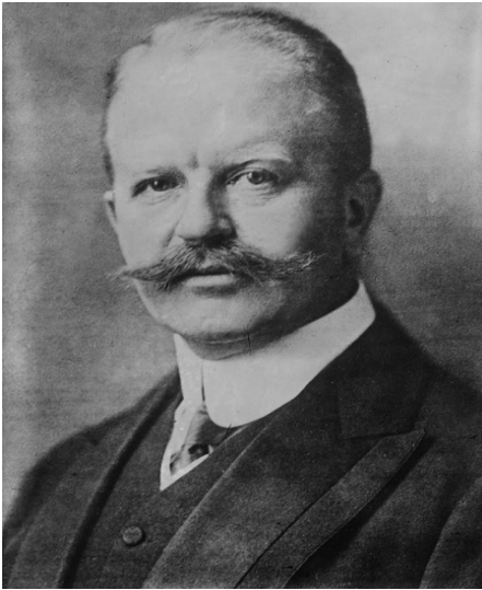
Arthur Zimmermann, German Foreign Secretary, World War I

In January of 1917, World War I raged across the globe, but the United States remained neutral. That month, the German Foreign Secretary Arthur Zimmermann sent a secret, coded message to the German ambassador of Mexico. The telegram helped change the course of World War I.