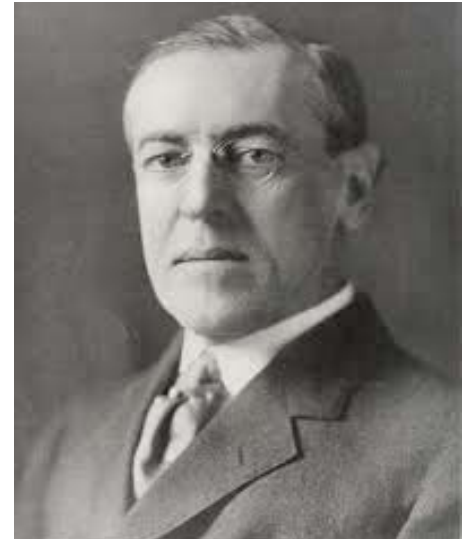
U.S. President Woodrow Wilson