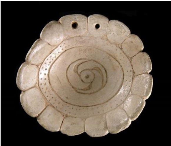
Shell Gorget, 41BW4, Bowie County

Here are some examples of marine shell gorgets found in Texas.