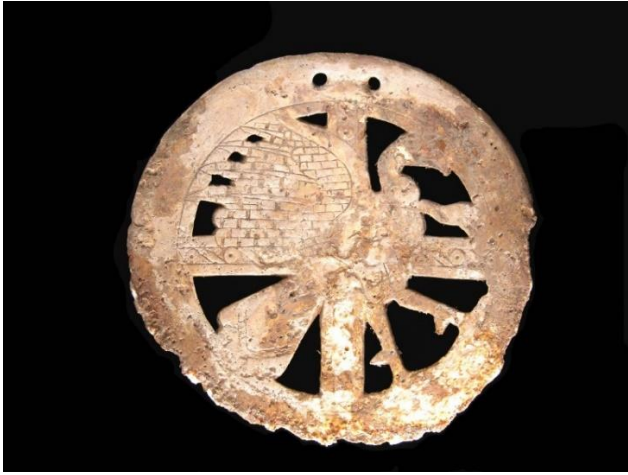
Shell Gorget, 41LR2, Lamar County