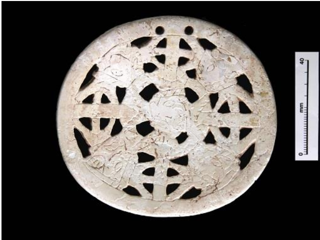
Shell Gorget, 41LR2, Lamar County

For more information about shell gorgets and marine shell ornaments visit the Texas Beyond History website at https://texasbeyondhistory.net/coast/nature/