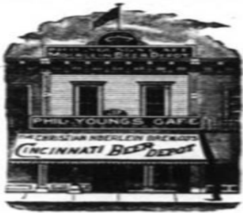
Moerlein Cincinnati Beer Depot

Advertisements, El Paso Daily Times , 1899