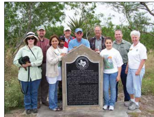
Above: Park Day at Palmito Ranch Battlefield NHL April 4, 2008

In an effort to interpret and preserve the history of this unique battle, the Texas Historical Commission (THC) has developed partnerships with local and national preservation organizations, such as Palo Alto Battlefield National Historical Park (NHP), the U.S. Fish and Wildlife Service—Santa Anna National Wildlife Refuge (USFWS), the American Battlefield Trust, the Cameron County Historical Commission, and the Brownsville Historical Association. In an effort to increase public awareness of this battlefield’s preservation needs, the THC and its local partners began [in April 2008] inviting the public to Park Day (a national clean-up and interpretation day at America’s Civil War battlefields, sponsored by the American Battlefield Trust and HISTORY™) at Palmito Ranch Battlefield.