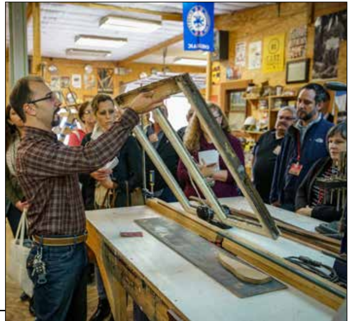
Courthouse stewardship workshop, Real Places Conference 2018.

Counties are encouraged to develop a cyclical maintenance plan for immediate and long-term care of their historic courthouse and grounds. A complete plan should include