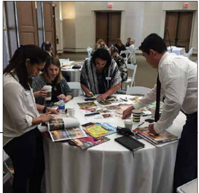
2019 Understanding Audiences and Visitors Workshop participants are creating visitor profiles.

database of history museums in the state via the THC's Texas Historic Sites Atlas ( atlas.thc.texas.gov ).