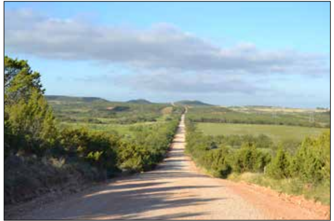
View along the Bankhead Highway in the vicinity of Sweetwater, Nolan County.