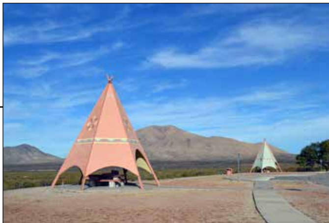
Roadside park with teepee shelters along I-10 frontage road (former Bankhead Highway) in the vicinity of Sierra Blanca, Hudspeth County.

The first project of the Historic Roads and Highways Program focused on the historic Bankhead Highway, a coast-to-coast roadway established in 1916 that runs from Texarkana to El Paso in Texas. The Legislature designated the Texas portion of the Bankhead as a Texas Historic Highway in 2009. Using Federal Transportation Enhancement funds, the THC and Texas Department of Transportation (TxDOT) coordinated to research, survey, and write reports about the Bankhead Highway, along with a Statewide Historic Context on Texas highway